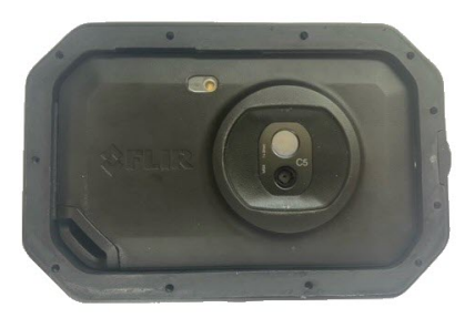
Figure 6.3 FLIR Cx5 case with FLIR C5 camera inserted.

1. Place the FLIR C5 camera into the case rear section with the touchscreen against the inner face of the case glass.