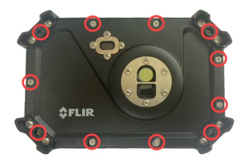
Figure 6.2 FLIR Cx5 main retaining bolts.

5. Gently push back the shock absorbers and separate the two halves of the case taking care not to lose any fixings.