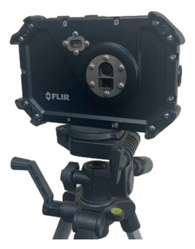
Figure 4.2 FLIR Cx5 attached to tripod.

The FLIR Cx5 case incorporates a centralised, bottom mounted tripod boss with a standard UNC \mathcal{W}^{\prime\prime}\mbox{-}20.