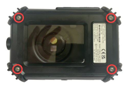
Figure 6.1 FLIR Cx5 shock absorber bolts.