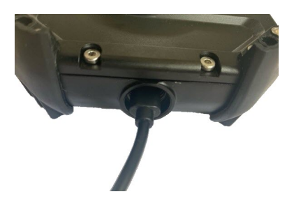
Figure 4.1 FLIR Cx5 with USB cable connected.