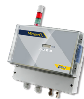
MICROX-OL Online Oxygen Analyser