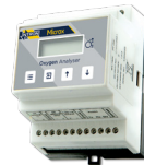
MICROX Oxygen Analyser