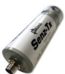
SENZTX Oxygen Transmitter