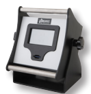
GAZTRAK Portable oxygen & moisture measurement