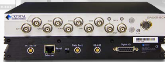
A highly modular, truly distributed, scalable dynamic measurement system introduced by Crystal Instruments.