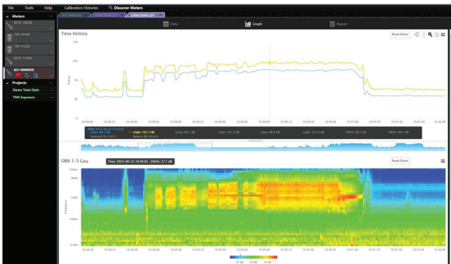
Time History Graph with optional 1/3 Octave Band data