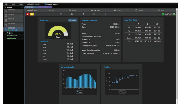
Live Sound Measurement View