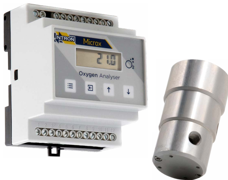
Din rail mounting option pictured with remote zirconia flow-through sensor. Wall and panel mount analyzer options, and electrochemical sensors with range of process connections also available.

The zirconia sensor delivers fast response times and a long service life with low drift, whilst the electrochemical sensor allows measurement of background gases containing hydrocarbons. Microx consists of a remote sensor that can be located near or inside the process, with multiple measurement ranges available.