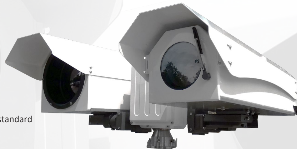
Above: Typical Jaegar Searcher, wiper optional (models will vary)

* Requires the NexOS performance pack and the gyro options