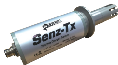
Senz-TX Oxygen Transmitter