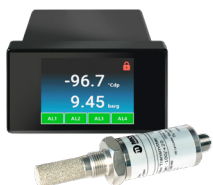
Easidew Advanced Online Dew-Point Hygrometer