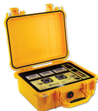
YellowBox Portable Portable Oxygen Analyzer