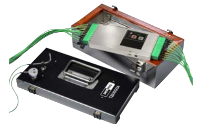
AutoPaq 20 channel system