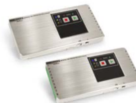
TP6116 and TP6216 data logger

* For full specification information including telemetry and Bluetooth approvals, refer to Datapaq TP6 radio telemetry datasheet.