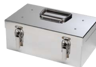
TB0021 thermal barrier