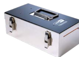
TB0050 thermal barrier