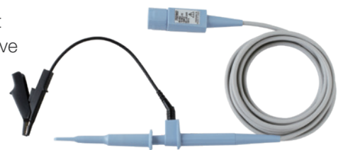
702902 (for isolated BNC)

A range of probe tip conversion adapters is available to connect the probe to the application in the most convenient way such as: safety mini clips, fork terminal adapters and small or large alligator clips. Also 4 mm conversion adapters with pincher tip/safety banana connectors are available.