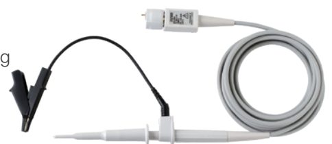
702906 (for non-isolated BNC)