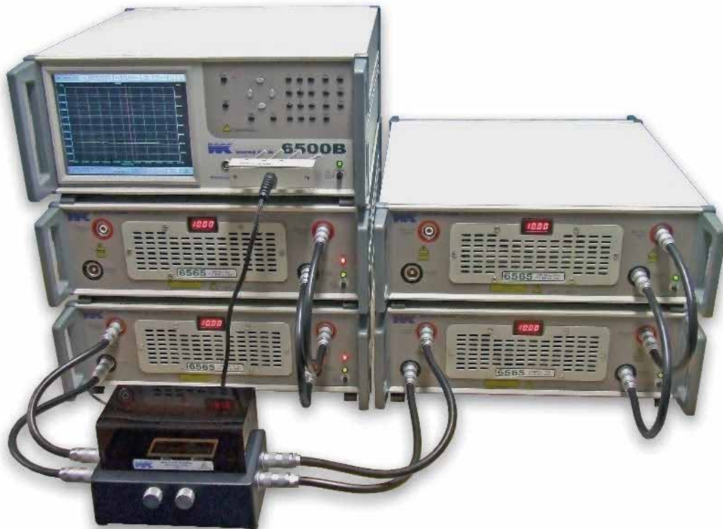
Typical 120 MHz 40 A DC Bias Current System (using 65120B, 4 x 6565-120 and 1027 Fixture)