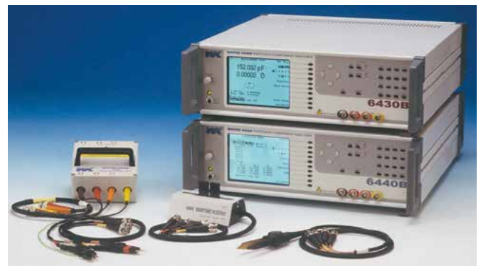
Accurate component analysis to 500 kHz (6430B) or 3 MHz (6440B) is simplified by many accessories which includes Overload Protection Unit 1J1100

The protection unit will protect the test equipment from up to 25 Joules of charged energy.