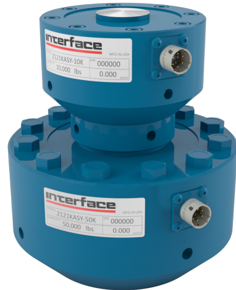
Model 2121-10K/50K (Shown)